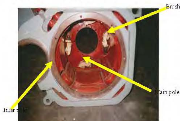
Fig. 1 Stator frame of motor

Traction motor is a four-pole, force-ventilated, series-wound DC traction motor, which is used for narrow-gauge diesel-electric locomotive. It has features of small size, light weight, wide speed regulating in the range of constant power, large margin of temperature rise and commutation, and good universality. Advanced manufacturing technology imported from the world and our mature experience in manufacturing have been used in manufacture processes. The magnet frame is welded with press formed steel plates, armature windings are made of Kapton file conductors and the ground insulation of armature windings uses NOMEX channel insulation. Integrative insulation structure is adopted to the coils and cores of main poles and inter pole, steel wire rebinding and VPI are applied in producing the armature.