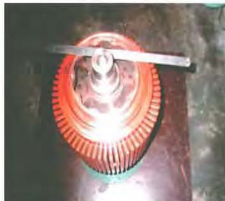
Fig. 2 Armature core